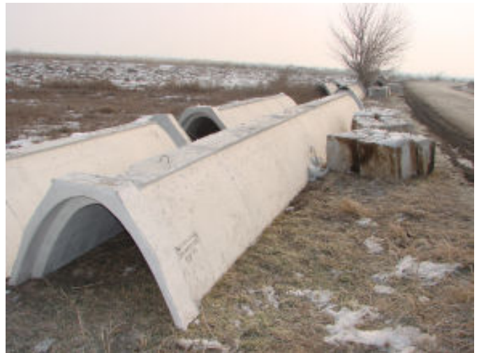
Concrete prefab canal sections